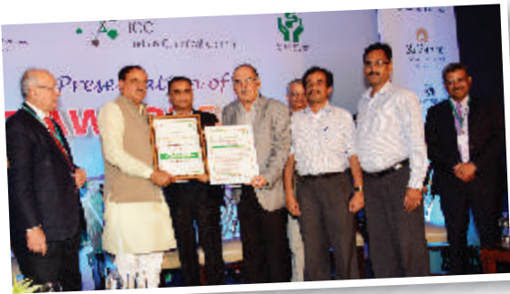
CENTURY RAYON: Excellence in Energy Conservation & Management