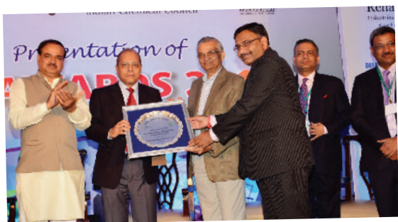
LANXESS INDIA: Water Resource Management in Chemical Industry