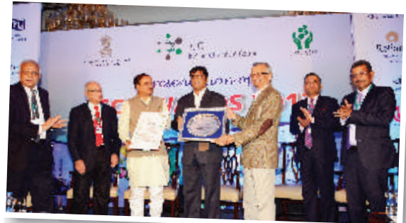
ESSAR OIL: Water Resource Management in Chemical Industry