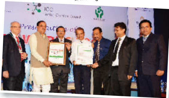
NATIONAL PEROXIDE: Certificate of Merit for Excellence in Energy Conservation & Management