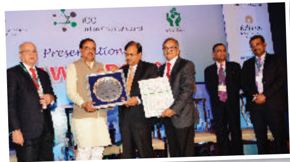
ASIAN PAINTS: Excellence in Energy Conservation & Management