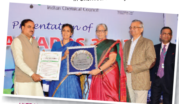
ULTRAMARINE & PIGMENTS: For Social Responsibility