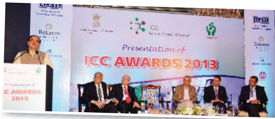
Mr. Ananth Kumar, Hon'ble Minister Addressing The Gathering