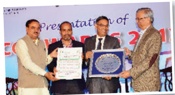
SOLVAY SPECIALITIES INDIA: Water Resource Management in Chemical Industry