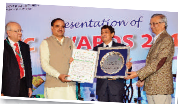
RELIANCE INDUSTRIES : For Social Responsibility