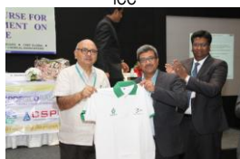
Releasing RC T-shirt - A symbol of Commitment