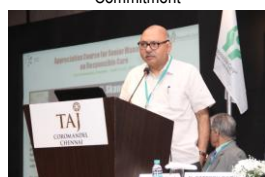
Address by the Chief Guest

The Indian Chemical Council (ICC) and the Tamilnadu Pollution Control Board (TNPCB) have joined hands for initiating interventions to support the Chemical Industry for achieving inclusive and sustainable development. One of the key initiatives identified under the joint programme includes promotion of "Responsible Care®", a global voluntary programme being implemented in 58 economies including in India, administered by ICC for Indian chemical industries.