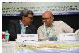
VP-ICC and Chairman, TNPCB discussing on way-forward