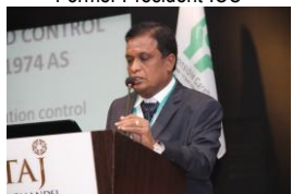
Presentation by MS, TNPCB